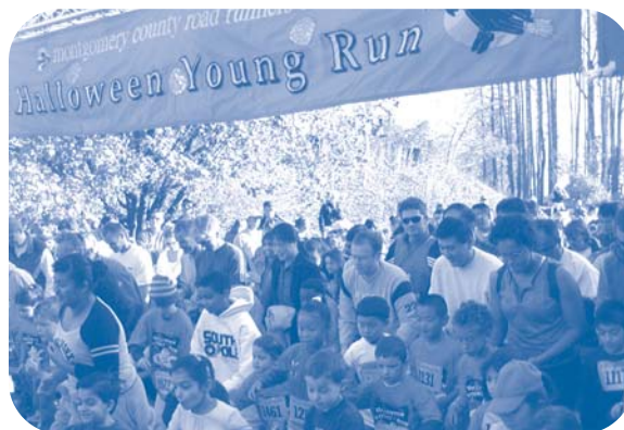
Last year more than 2,800 children participated in the Halloween Young Run. Come out and cheer on all the children who will be out running on November 6th.

Lace up your sneakers and prepare to hit the road on November 6 for the Montgomery County Road Runners Halloween Young Run. As in past years, FSAI's Healthy Families Montgomery program is one of the benefiting charities.